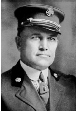
Chief Joseph Randall 1909 to 1927